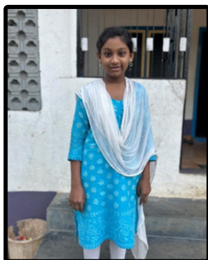
Baby 13yrs - 6th grade

What did you enjoy most about Christmas Service this past year?